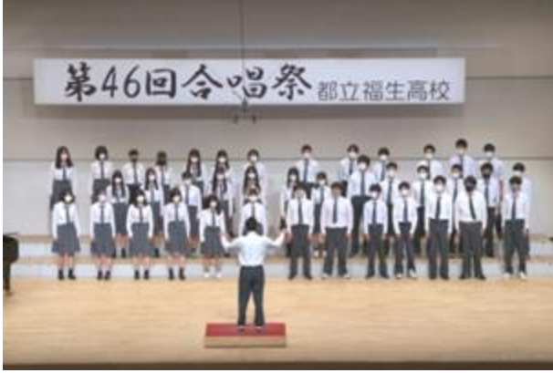
■ Chorus Festival