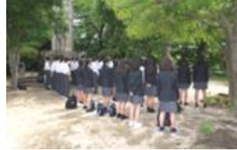
■ Chorus Festival Practice