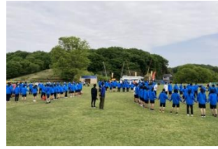
■ Field Trip