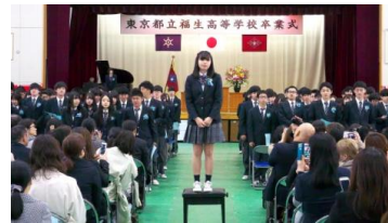
■ Graduation Ceremony