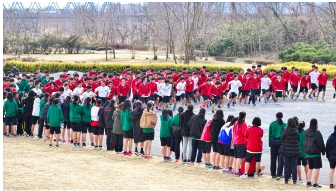
■ Marathon Race