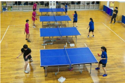
Table Tennis Club