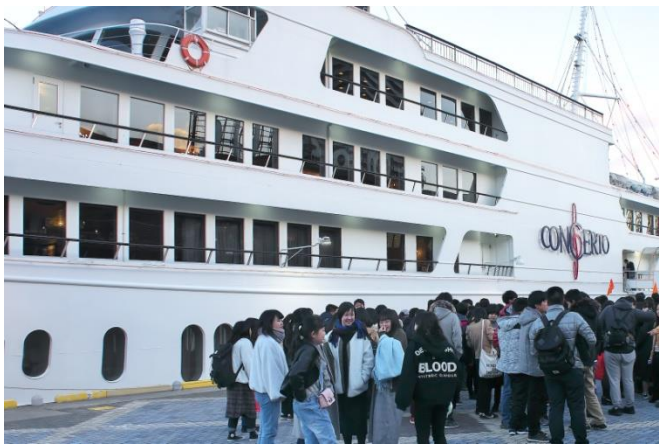
■ School Trip to Kobe, Kansai