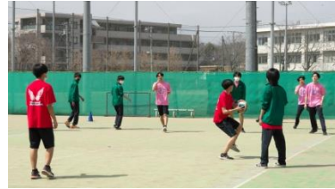
■ Sports Matches by grade level