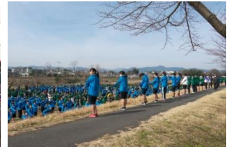
■ Marathon Race