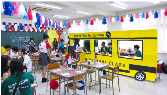
■ Cultural Festival