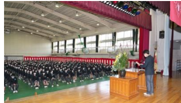
■ Graduation Ceremony