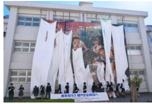
■ Giant pasted picture ceremony