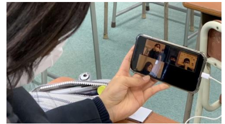
Interacting with Zoom