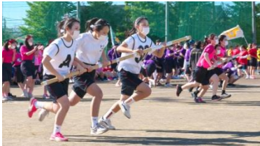
■ Sports Festival