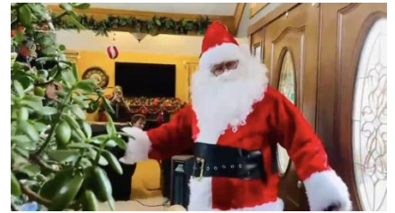
An Americany Christmas Through Zoom

So far, we have conducted online exchanges via Zoom and Christmas gift exchanges with high schools in Canada, Malaysia, Taiwan, the U.S., and the Philippines. For instance, the third-year English conversation elective class held online collaborative lessons via Zoom with a Filipino high school once a month.