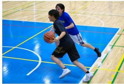
Girls' Basketball Club